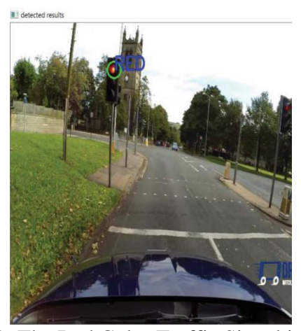
FIGURE 1: The Red Color Traffic Signal is Detected.