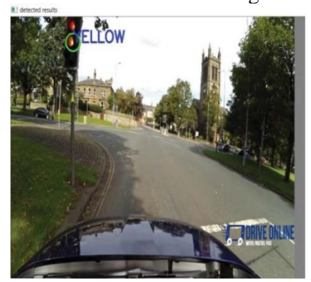
FIGURE 2: The Yellow Color Traffic Signal is Detected.